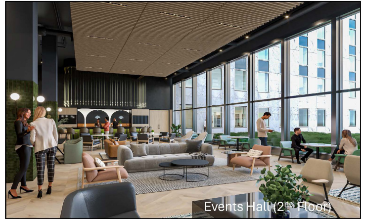
Wacker Drive Lobby