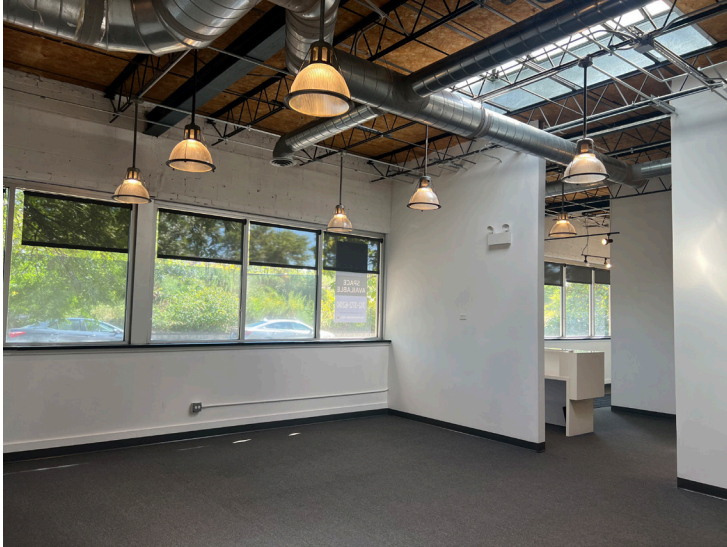
FRONT OFFICE AREA