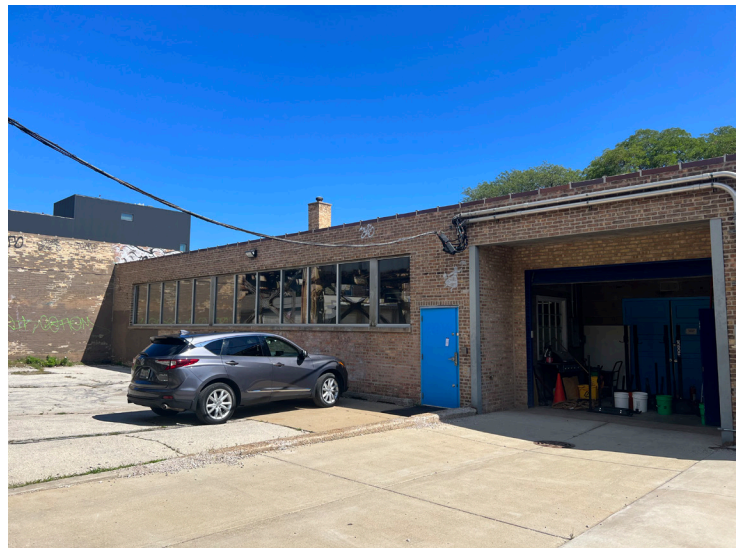
PARKING & OVERHEAD DOOR