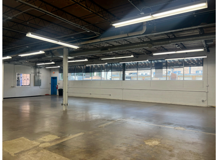
REAR OPEN SPACE