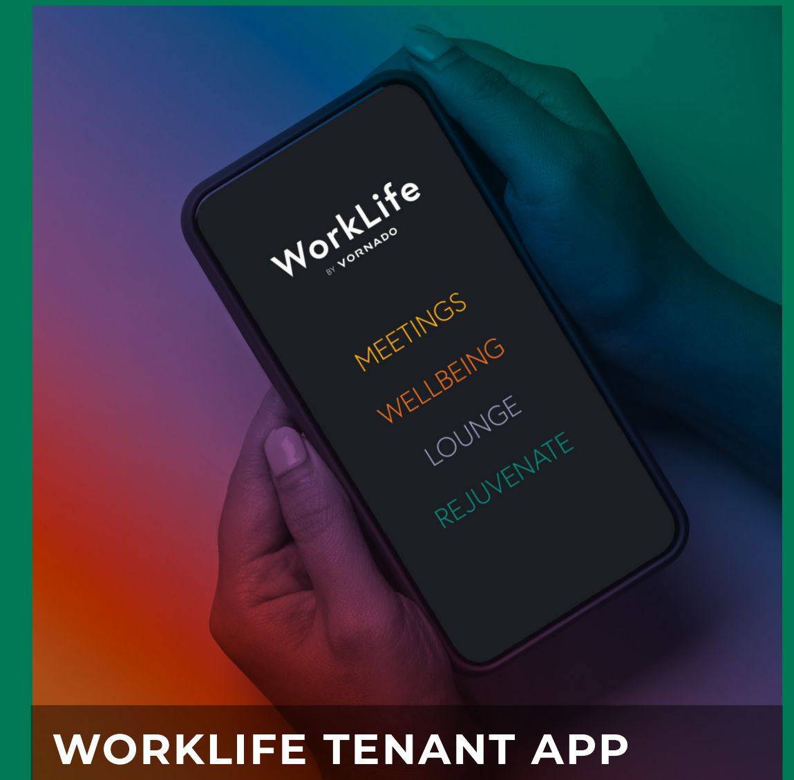
WORKLIFE TENANT APP