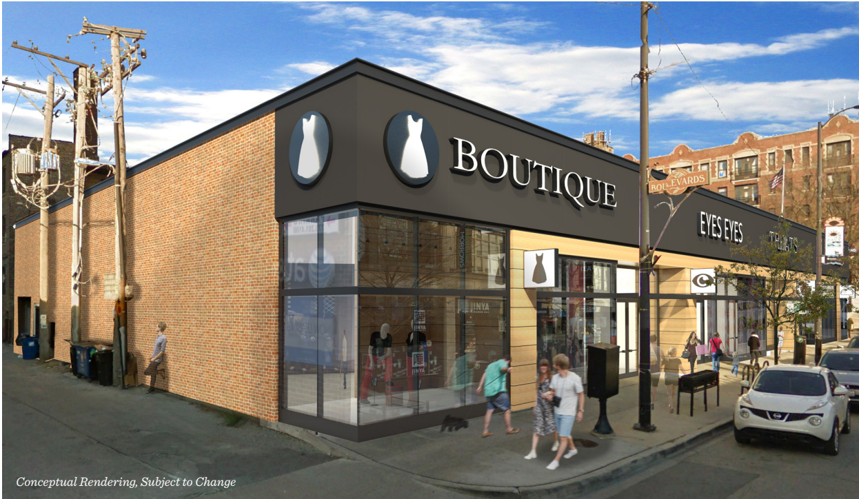
Conceptual Rendering, Subject to Change