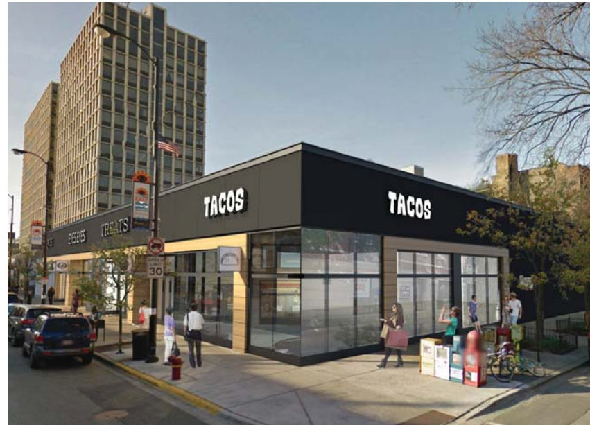
Conceptual Rendering, Subject to Change